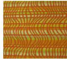
Q1008 Gimbel- wave Mango (E) Polyester-