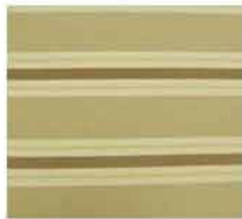
Q1005 Carnalu- row Hemp (E) Polyester- Railroaded