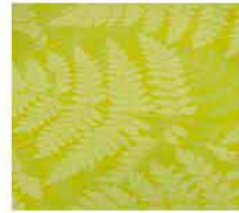
Q1004 Poolside Daisy (E) Polyester