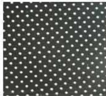
58112 Flirt Onyx (C) 38% Polyester 62% Acrylic