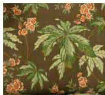
PK896F Seville Mink (B) Polyester