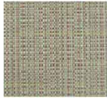
8305 Linen Se- dona (C) Acrylic