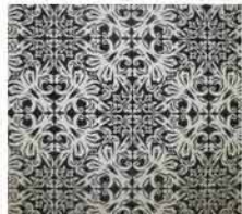
Q1003 Valhalabay Onyx (E) Polyester