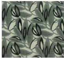
Q1006 Lilypond Panda (E) Polyester