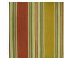
PK527S Larrabee Lacquer (C) Polyester