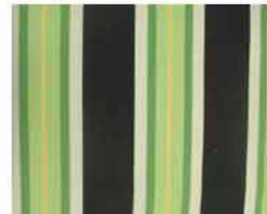
PK901S Roslyn Black (C) Polyester