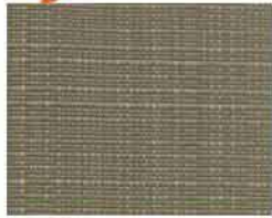
8374 Linen Taupe (C) Acrylic