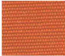
5417 Tuscan (C) Acrylic