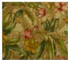
PK208F Jefferson Café (B) Polyester