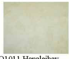
Q1011 Hanaleibay Pinacoloda (E) Polyester

All fabrics are photographically reproduced and cannot be guaranteed for accuracy