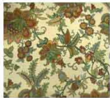
MPS Paradise Sienna 2 (B) Polyester