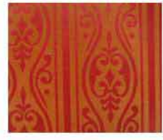
59856 Oregon Trail (B) 53% Polyester 47% Acrylic