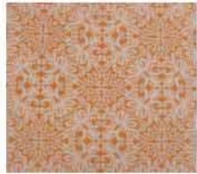
Q1002 Valhalabay Mango (E) Polyester