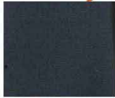
5439 Navy (C) Acrylic