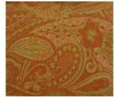
5335 Pasha Ginger (E) Acrylic