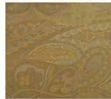
5332 Pasha Mercury (E) Acrylic