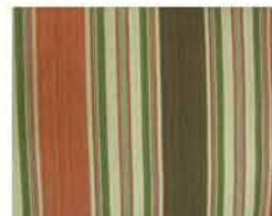
PK896S Larrabee Mink (C) Polyester